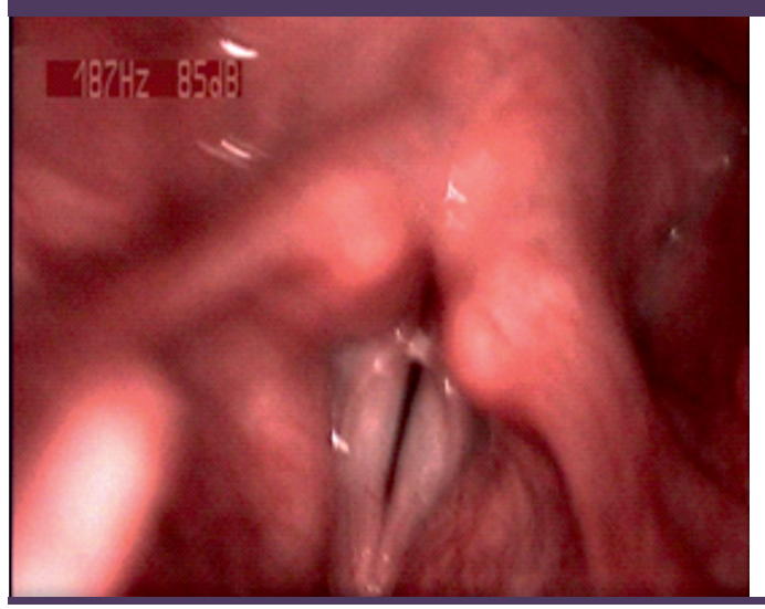
Figuro 4 Videolaryngoscopy and stroboscopy after total recuperation. QR code for the video

After diagnosis, he was referred to speech